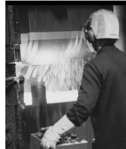
Castrol Anvol SWX Full separation