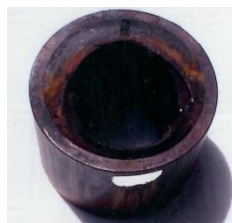
Bushings condition before Castrol