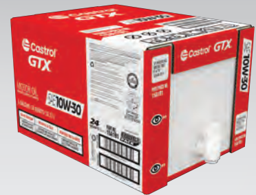
Castrol GTX 0W-20, 10W-30, 5W-20, 5W-30