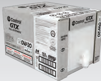
Castrol GTX Full Synthetic 0W-20, 5W-20, 5W-30