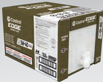
Castrol EDGE Euro Car 5W-40 A3B4

You strive to sell incremental premium oil changes, but may lack space to add additional bulk tanks, or the area to store quart cases and drums. Castrol E-Pack and E-Rack present a complete solution, offering an expanded selection of premium products and an efficient way to store them.